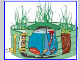
Best Management Practices (BMPs)