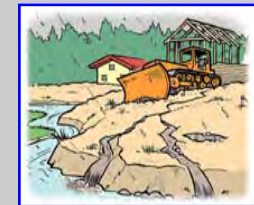
Erosion Prevention and Sediment Control

To report stormwater quality concerns contact: