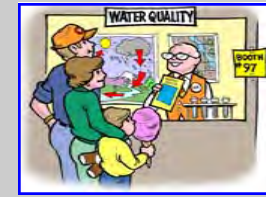
Education and Outreach