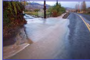
Flooding of road and drainage ditch in Jackson County.

Increased hardened surfaces in urban areas results in more water draining directly into streams. The increased flow causes flooding and erosion of stream banks.