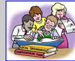
Changes in Local Policies